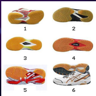
ONLY GUM SOLE SHOES ARE ALLOWED ON THE COURT

North Indian Association, Bhaudaji Road Extn., Behind King's Circle Station, Sion, Mumbai - 400 022