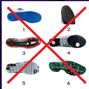
SHOE SOLES THAT ARE NOT ALLOWED ON COURT