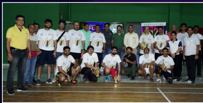
Members of all ages enthusiastically participated in the Printers' Badminton League 2022